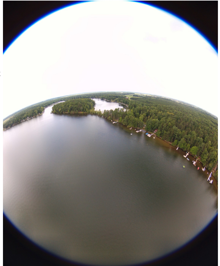
Gibson Island, in the top center, takes on a different look in this photo taken from a drone with a fish-eye lens. The angle is facing west from Pine Lake.

The overwhelming response from people is that they enjoy and respect the beauty of Gibson Island. However, sadly a few people decide to vandalize and litter. For example, no matter how many times a person vandalizes the "no dog" signs, the fact remains that the rule still applies. We simply request that they stop!