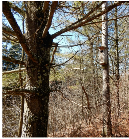
A wood duck nest along the river.

Petersen, 76, is a widower who has four daughters and five grandchildren who frequently visit the farm and enjoy Mother Nature. Sometimes they even help him with having. When they were children,