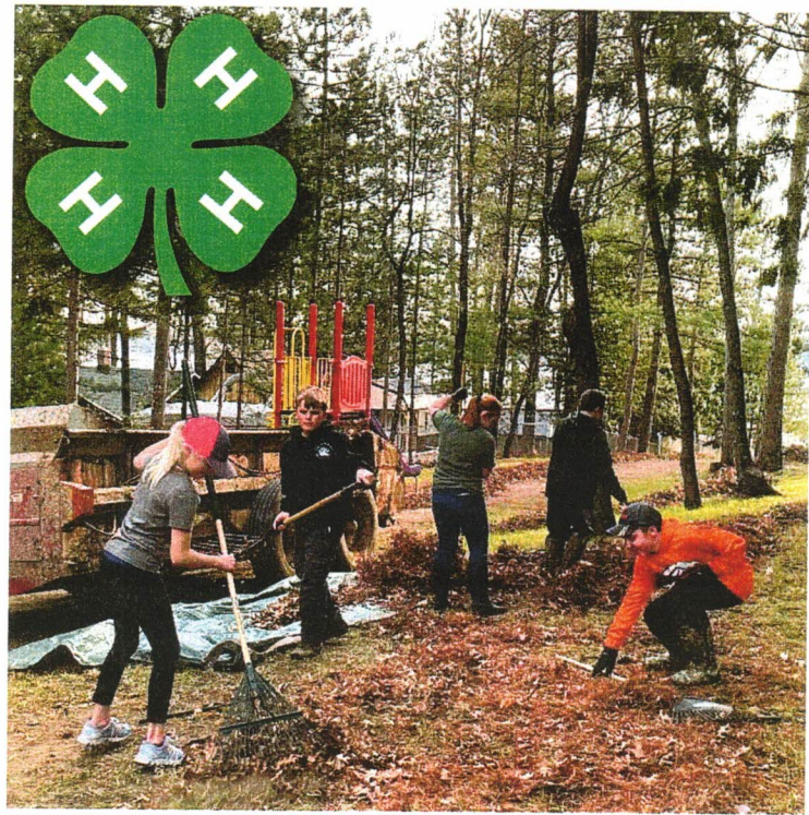
Belle Plaine 4-H Cleaning up at Sandy Beach located on the Cloverleaf Lakes.

If you would like to join Belle Plaine 4-H the contact number for the extension office is 715-526-6136. Meetings are the 3rd Sunday of the month at 6pm at the Belle Plaine Community Center located at N3002 State Highway 22 Clintonville, WI 54929. Kindergarten thru 1 year after senior year are eligible.